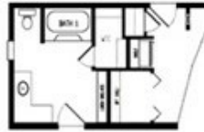
OPTIONAL LAUNDRY IN KITCHEN