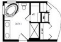
OPTIONAL DELUXE BATH (NOT AVAILABLE WITH WALK UP STAIRS)